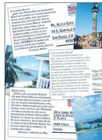
Postcards from Puerto Rico, page 297

Más conversaciones entre compañeros(as) de clase: Using chapter vocabulario and the Sentence Generator, students ask and answer questions.