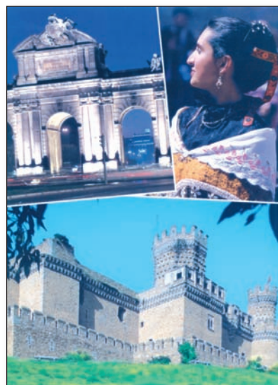
Photos of Spain, page 172

Los ejercicios: a wide range of oral, aural, and written exercises to meet the needs of diverse teaching and learning styles.